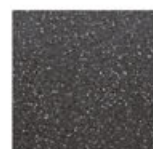
TS 80 anthracite