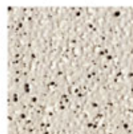
Granular surface (R 11/B)