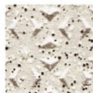
Star point studded surface (R 12-V4/B)