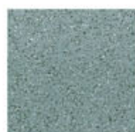
TS 50 mint