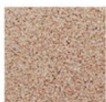
TS 20 rosé