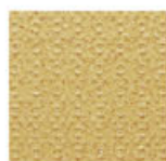
TS 30 yellow