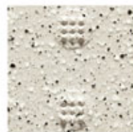
Round studded surface (R 13-V10/B)