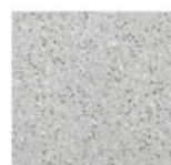
TS 60 grey