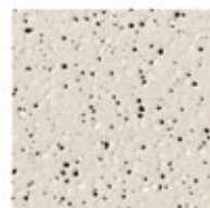
Level surface (R 10/A)