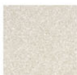
TS 10 white